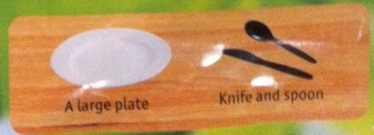
A large plate